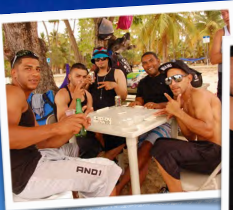
The boys take their dominos seriously.