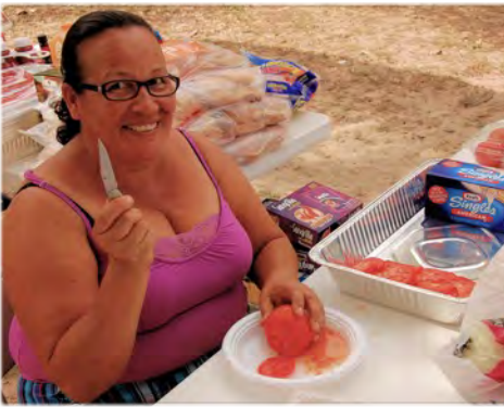
Never mess with Nelly while she is cooking- even though she is smiling!