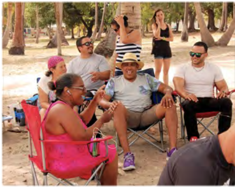
It was fun to listen to the most senior employees tell stories about the beginnings of 3MG.